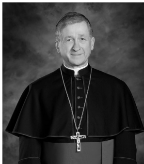
Archbishop Blase Joseph Cupich 9th Archbishop of Chicago

Installation: November 18, 2014, at Holy Name Cathedral