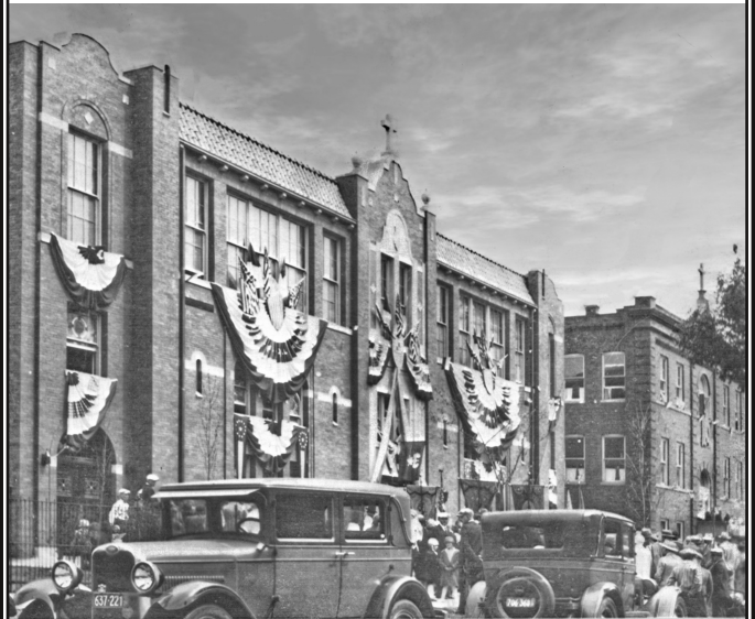
St. Florian Dedication - June 3, 1928